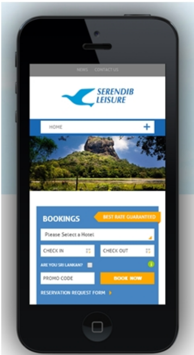
Appearance of the website on a mobile

Providing a user-friendly experience, the Serendib Leisure hotel website offers captivating visuals and informative content that combine to provide a glimpse into all we offer be it the stylish accommodation, stunning natural settings, one of a kind dining venues, range of leisure amenities or ideal event spaces for meetings & weddings. Catering to independent travellers on a journey of discovery, couples in search of romantic retreats which to celebrate their love and families wanting to embark on unforgettable adventures together, our hotels have something for everyone and with an online reservation feature incorporated into our website, booking accommodation can be done with just a few clicks of a button.