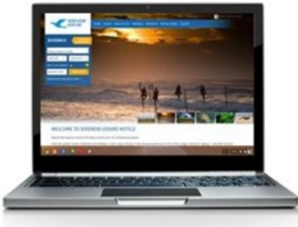
Appearance of the website on a computer